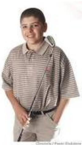
U.S Amateur – Age 14